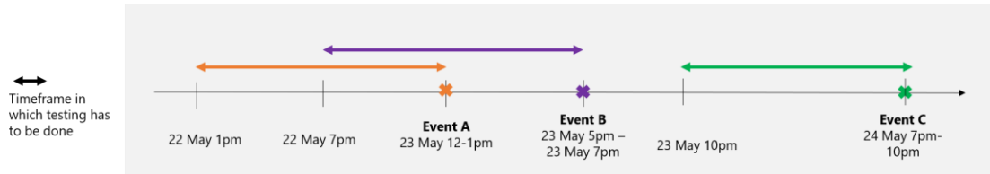
Diagram 1: Worked Examples for when an attendee/ patron should be tested