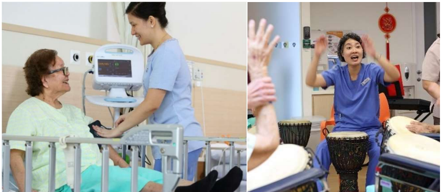
Credits: (Left) Nursing care at SACH, (Right) Music therapy for patients with dementia at SACH

Examples of conditions requiring sub-acute care after stabilisation of acute issues are congestive heart failure, ischaemic heart diseases, infectious disease conditions including chest infection, skin infection, kidney failure patients and post-operative patients requiring medical and nursing care.