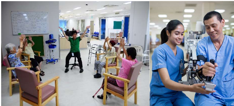
Credits: (Left) Group therapy at RCCH, (Right) Physiotherapy at AMK-THKH

Examples of conditions requiring rehabilitation care after stabilisation of acute issues include brain injury and other neurological conditions (stroke, traumatic injury, Parkinson's disease etc.), as well as fractures and hip replacements.