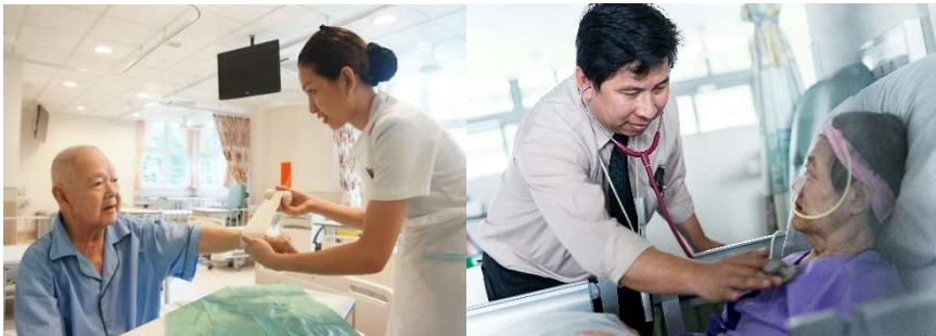
Credits: (Left) BVH's nurse providing wound care, (Right) YCH's doctor checking on patient

d) Wound care : Patients with wounds that require medical and nursing care may be transferred to community hospitals after their medical conditions are stabilised at the acute hospitals.