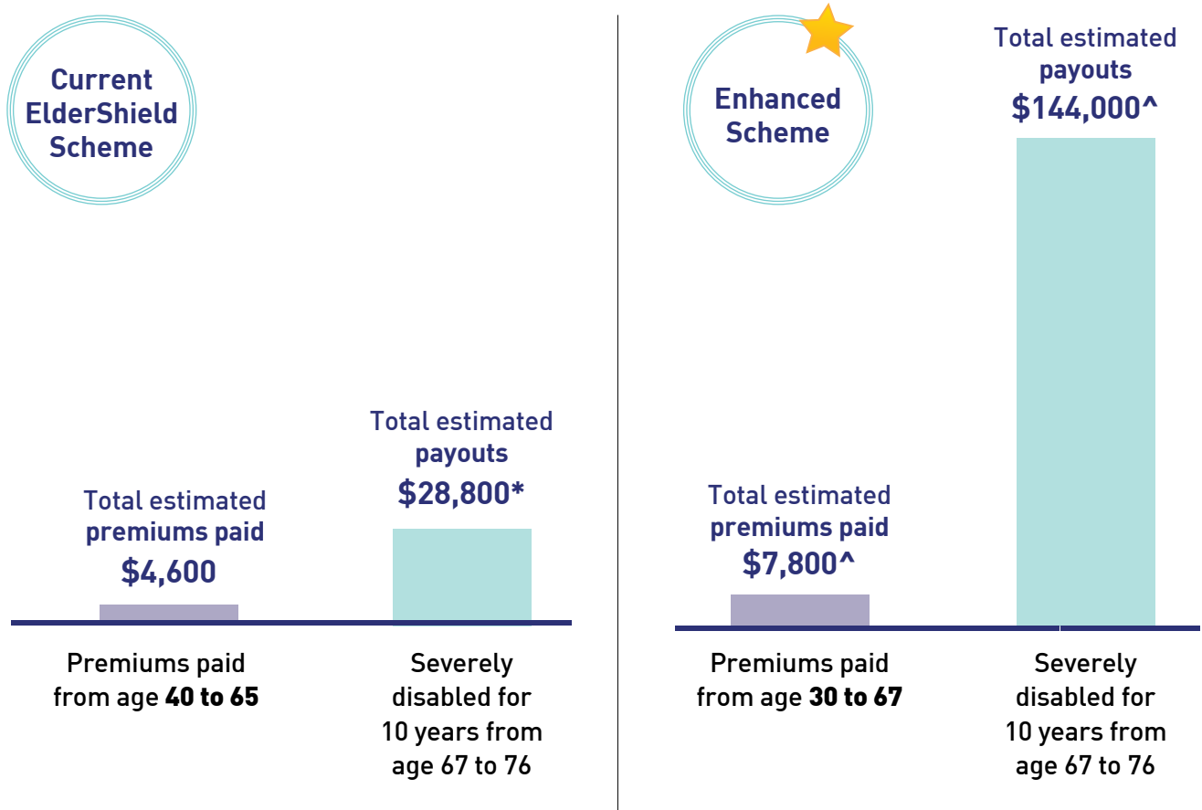
Figure 3: Comparison of total estimated payouts received and premiums (net of subsidies) paid by a 30-year-old low-income male policyholder who becomes severely disabled for 10 years at age 67

Note: Premium and payout figures are rounded to the nearest hundred.